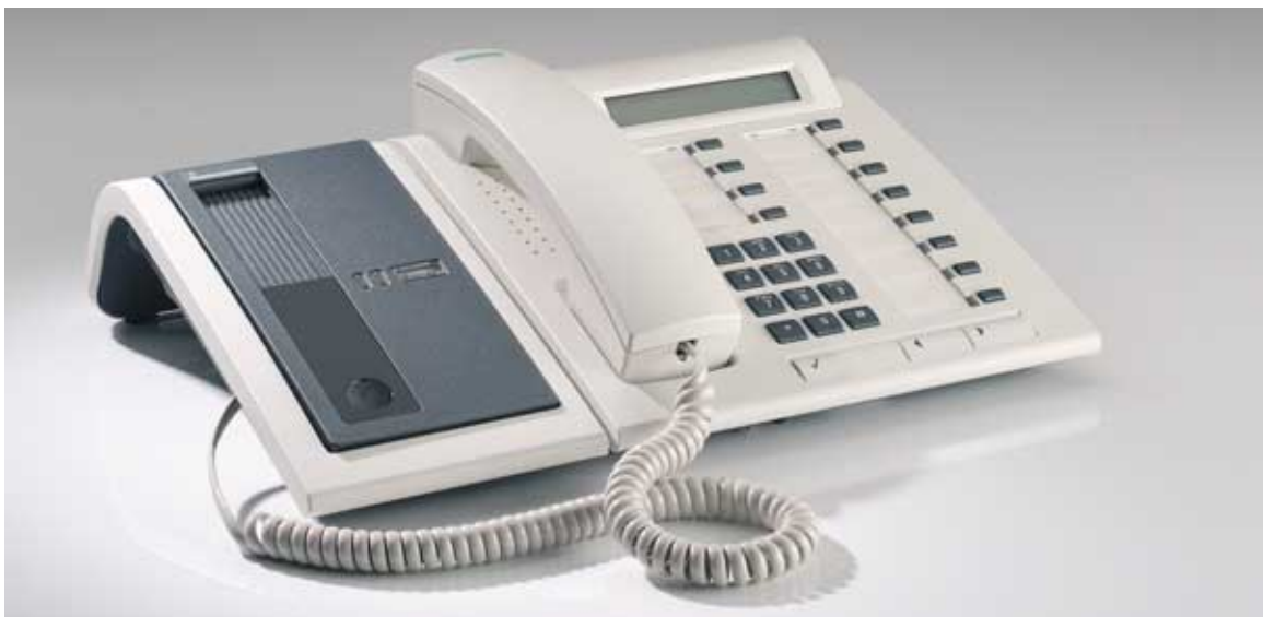
Optiset E privacy module with Optiset E telephone and support tray

Optimum speech quality in encrypted mode is ensured by automatic matching to the impedance of the telephone used.